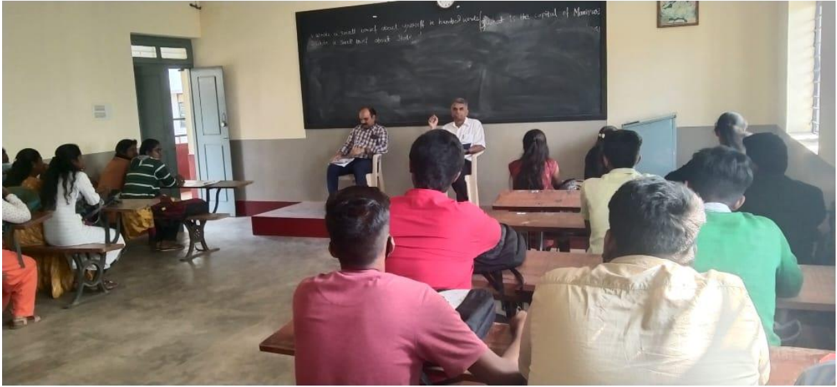
CRs' meeting held on 18-04-2022