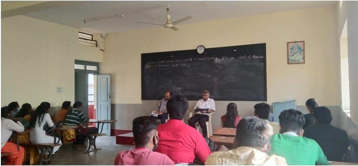
CRs meeting held on 17-05-23