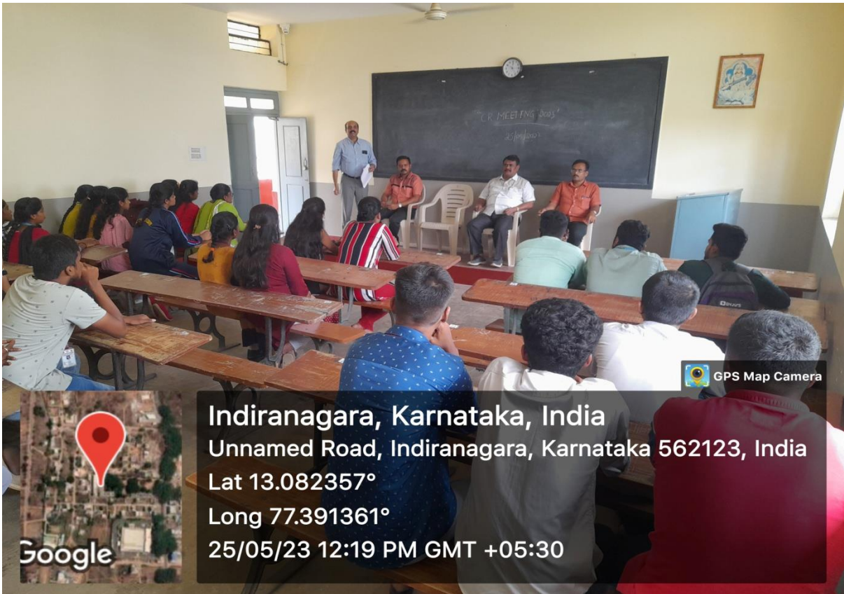
CRs meeting held on 25-5-2023